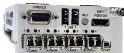
SMP HP MODULE (INSTALLS IN CHS-HP CHASSIS)

The Linux-based SMP HP Module is built for large-scale matrix switching environments. Powered by an Intel® i7 processor, it delivers centralized system management for 640+ port deployments with copper (RJ45) or optical (fiber) network connectivity.