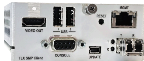
OSD MODULE (INSTALLS IN STANDARD CHS CHASSIS)

Flexible user access and control - delivered through secure, purpose-built interfaces for any SMP deployment.