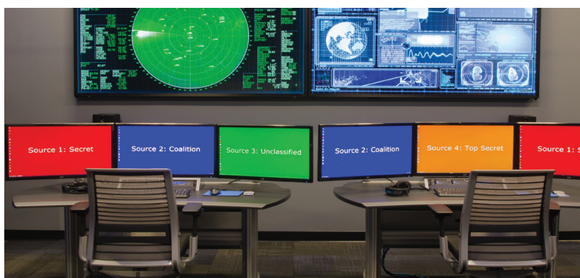
AN ENVIRONMENT WITH THINKLOGICAL...