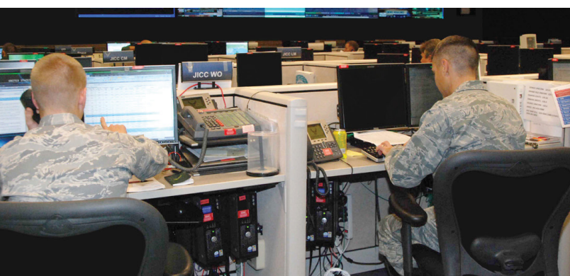
AN ENVIRONMENT WITHOUT THINKLOGICAL...