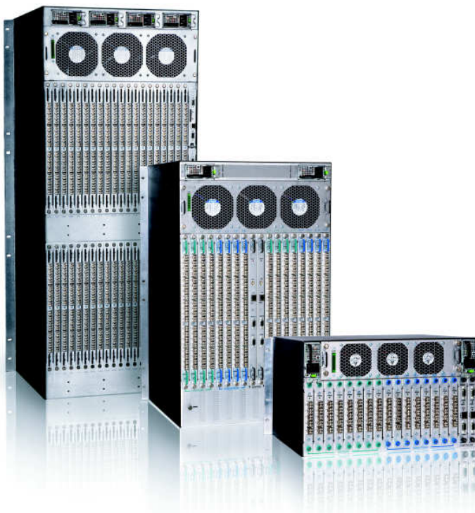
Thinklogical's VX Router Series