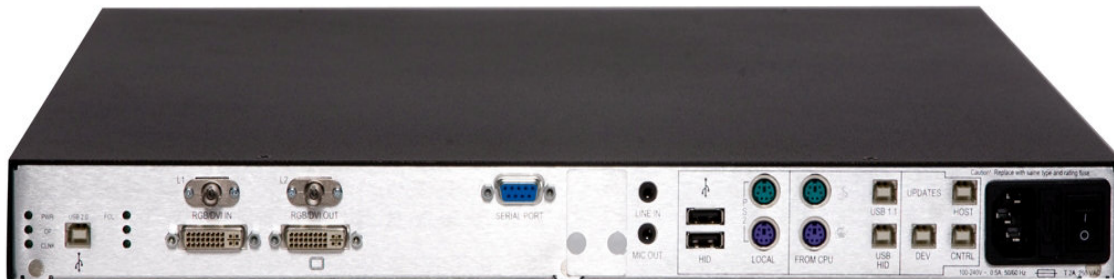
Velocitykvm Extender - 5 Transmitter, Multi-Mode