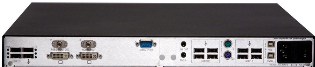
Velocitykvm Extender - 5 Receiver, Multi-Mode