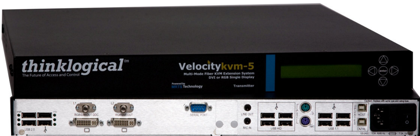
Velocitykvm System - 5, Transmitter and Receiver, Multi-Mode Fiber