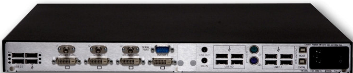
Velocitykvm Extender - 24 Receiver, Multi-Mode