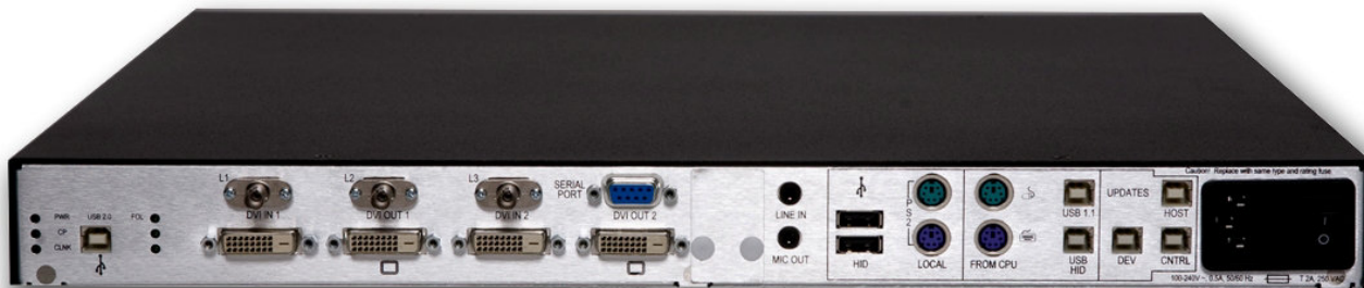
Velocitykvm Extender - 24 Transmitter, Multi-Mode