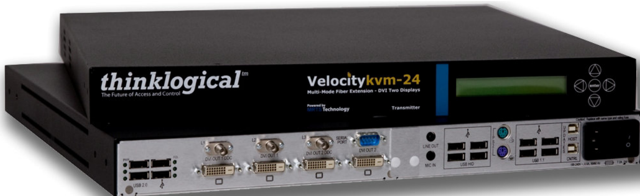
Velocitykvm System - 24, Transmitter and Receiver, Multi-Mode Fiber